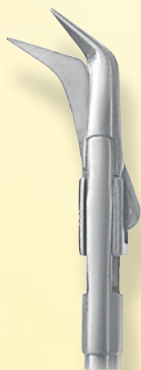
252-800-007 45° angled, sharp, single action