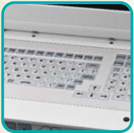
Also available: Built-In-KeyBoard-Version (300-001-455)