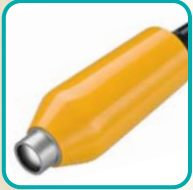
Bright LED light source with 20.000h life time, no external light source is needed

The visualization system is a combined light source-camera display unit. This consists of a color video camera with remote camera head, a remote LED light source, integrated LCD and USB memory unit. The visualization system is intended specifically for use in medical endoscopy and diagnostics.